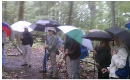
A recent wet hike along the new Northridge Trail by 35 members of the FG Hiking Club.