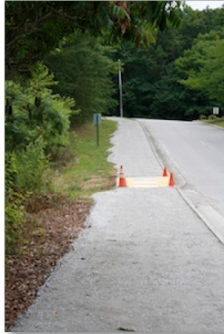
Final piece of Village Drive Sidewalk nearly complete

After a long wait you no longer have to dodge traffic to complete the 2.2-mile Kingsboro Sidewalk Loop. Over the last few days construction workers have been digging out the sidewalk trail bed and laying a foundation of sand and gravel in the two sections of missing sidewalk. On Kingsboro Drive a quarter of a mile section was missing at the Catoosa Boulevard end. On Village Drive a short section, just over 100ft, was missing at the Stonehenge end. The financing for this construction was approved at the last Board of Directors Meeting and the Community Club awarded a contract a few days later. The contractor has done the work